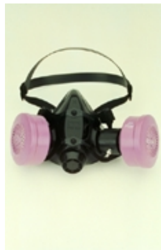
Facepiece with fit test adapter inserted