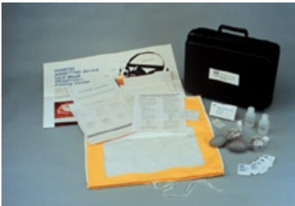
Bitrex QLFT kit

Detailed protocols for qualitative fit testing are provided as part of the standard (see Appendix B of the standard in Appendix I of this document).