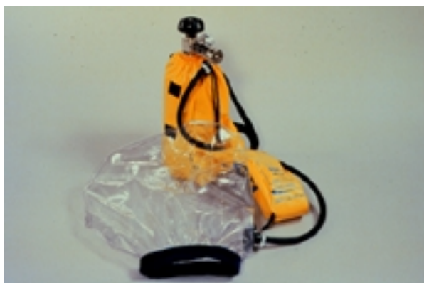
Emergency escape breathing apparatus

(d)(2)(iii) You must consider all oxygen-deficient atmospheres to be IDLH. Atmosphere-supplying respirators must be used in oxygen-deficient atmospheres (where oxygen is less than 19.5%). You may use any atmosphere-supplying respirator if you can demonstrate that, under all reasonable foreseeable conditions, the oxygen concentration in the work area can be maintained within the ranges specified in the following table (Table II of 29 CFR 1910.134). Otherwise, you must provide employees with full facepiece pressure demand SCBAs or combination full facepiece pressure demand supplied-air respirators with auxiliary self-contained air supply.