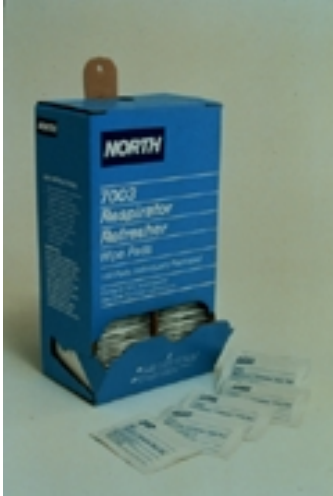
Respirator wipes are useful for cleaning

environment will require that the respirator facepiece, in particular, be cleaned more frequently.